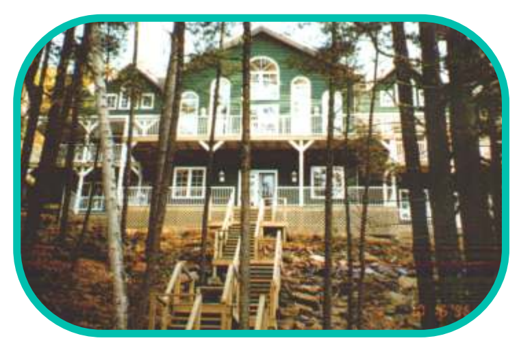
5900 sq. ft. R-2000