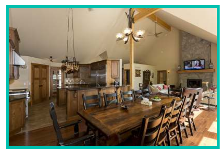
4538 sq. ft.