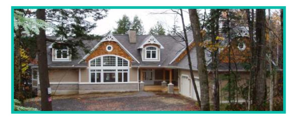
4614 sq. ft.