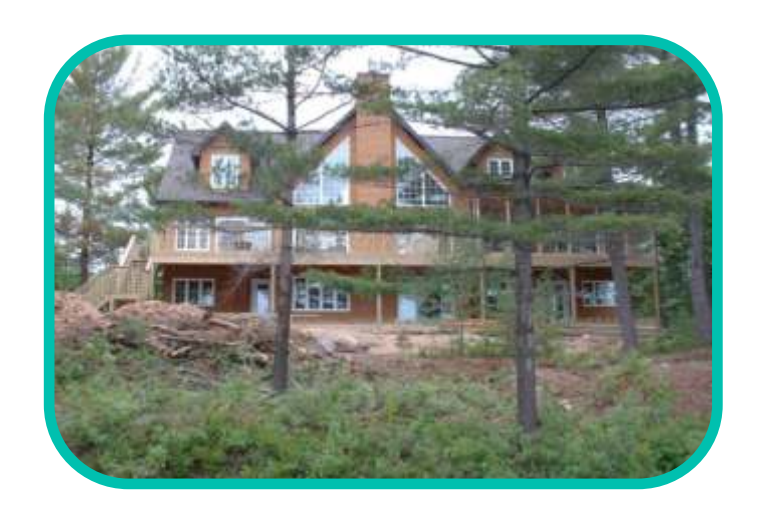
5500 sq. ft. R-2000