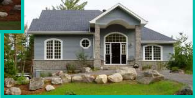
3470 sq. ft. R-2000