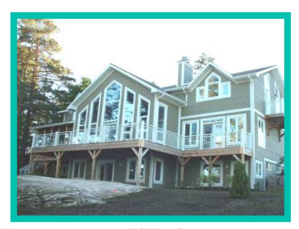
5915 sq. ft.