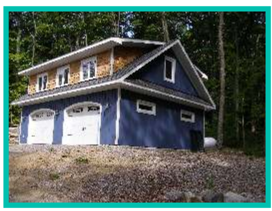
Garage & Storage