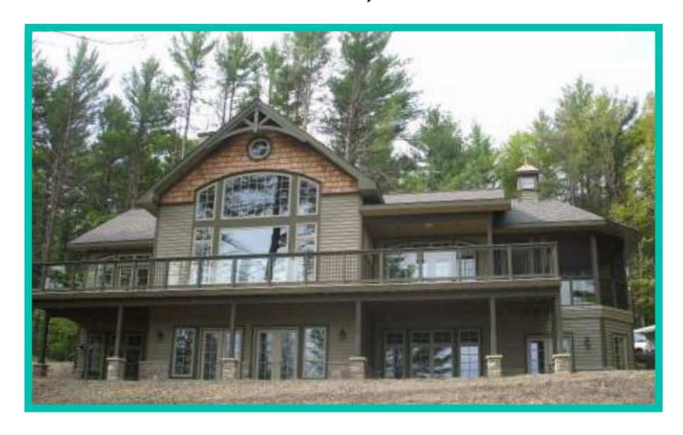
5194 sq. ft.