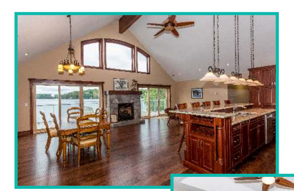
4050 sq. ft.