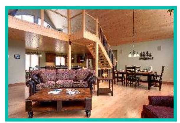
2526 sq. ft.