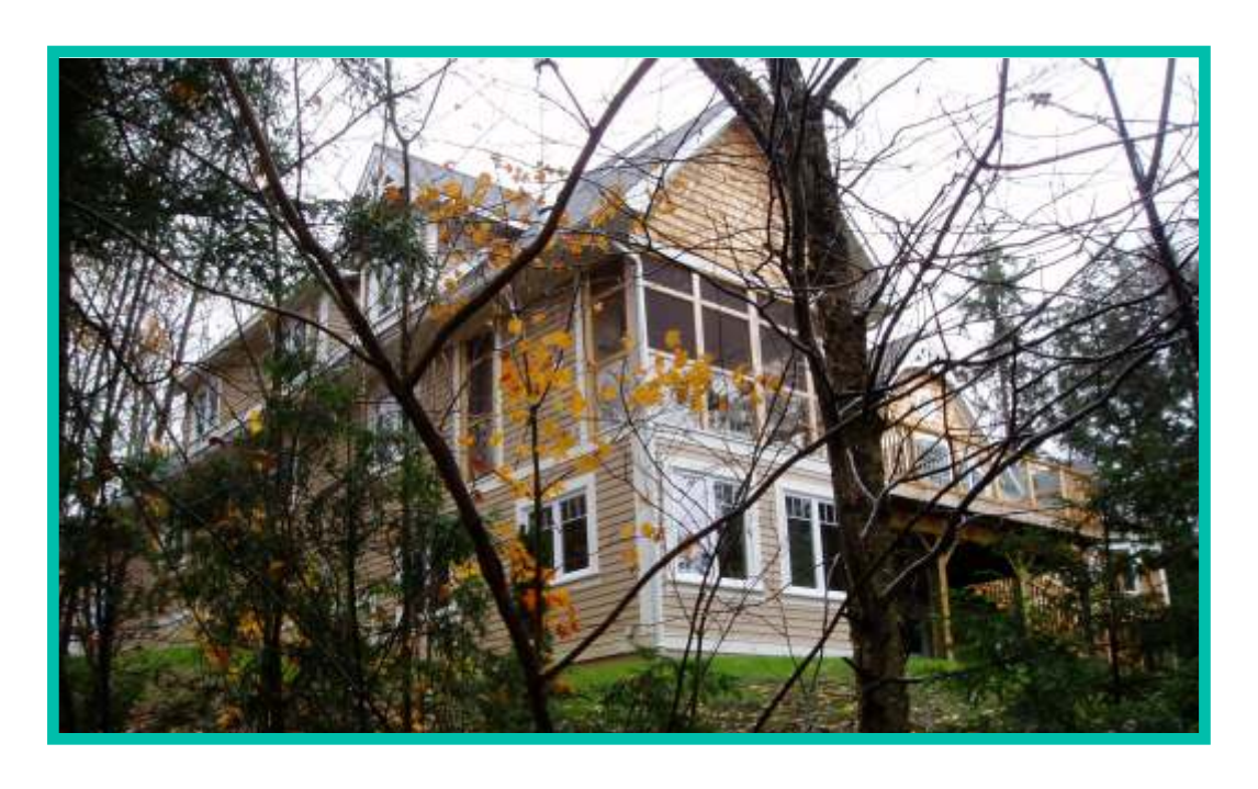
4614 sq. ft.