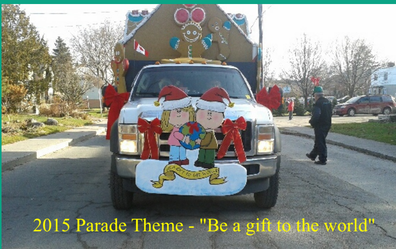
2015 Parade Theme - "Be a gift to the world"