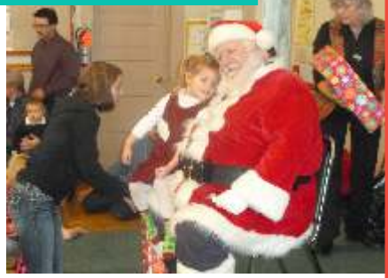
Santa came to visit at the Port Sydney Hall in early December