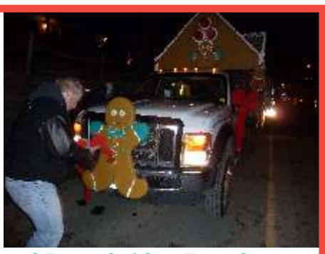
Thanks to the wonderful volunteers for helping with the Huntsville and Bracebridge Parades