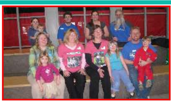
Walk for Memories 2013

** The 4" pleated media filters for your furnace are available at Dean's Home Hardware in Port Sydney.